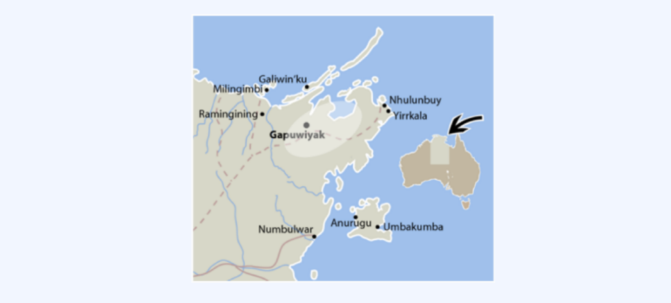
Established in 2014 by Yolŋu leaders, the Goŋ-Dֲäl Aboriginal Corporation is a social enterprise based in Gapuwiyak, a remote town in East Arnhem Land in the top end of the Northern Territory.