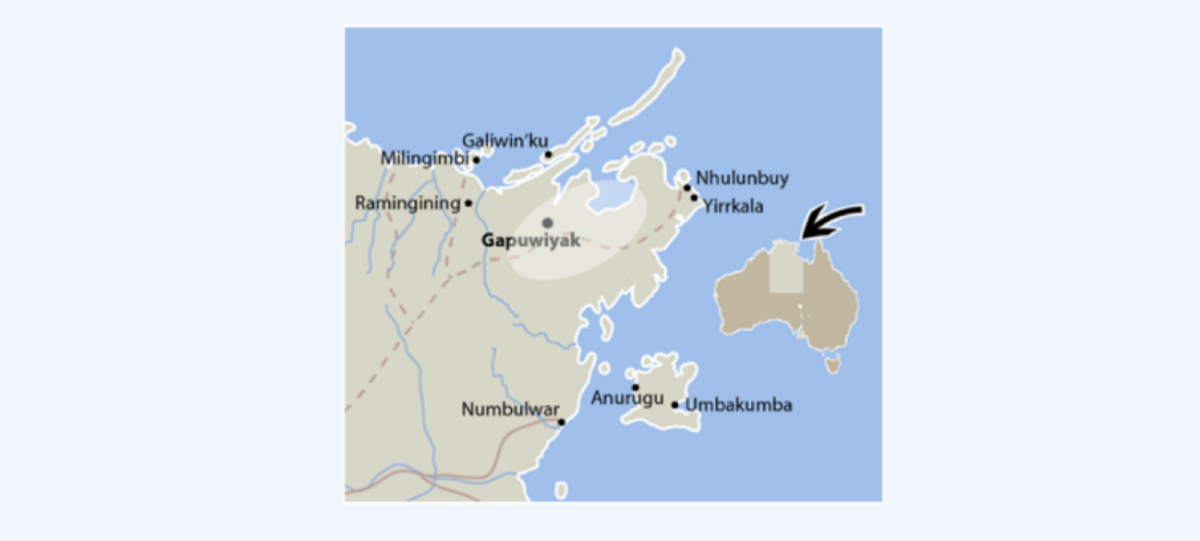
Established in 2014 by Yolŋu leaders, the Goŋ-Dֲäl Aboriginal Corporation is a social enterprise based in Gapuwiyak, a remote town in East Arnhem Land in the top end of the Northern Territory.

Goŋ-Dālwas established in 2014 by the Yolŋu people in East Arnhem Land, for the benefit of all Yolŋu clans and people living in the region. It takes its name from one of the founding leaders of this area who worked tirelessly to unite the Yolŋu clans and found the town of Gapuwiyak. He was given the familiar name 'Goŋ-Dāl' by his brothers ('Goŋ' means hand and 'Dāl' means strong, firm, and steady) because he displayed these qualities in everything that he did. Embodying his spirit and values, the vision of the corporation is: "Yolŋu peoples living culturally strong, healthy, self-determined and economically independent lives in our Homelands and Gapuwiyak".